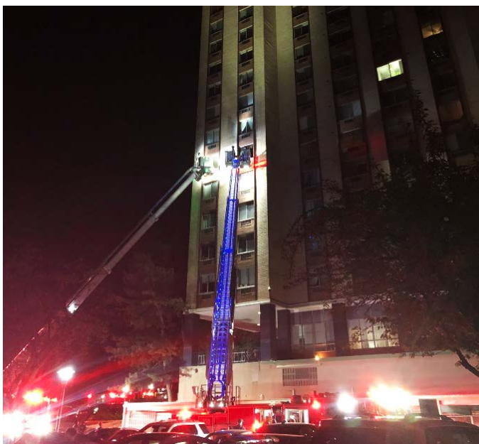
Firefighters on scene of a 27-story apartment building fire in Gaithersburg