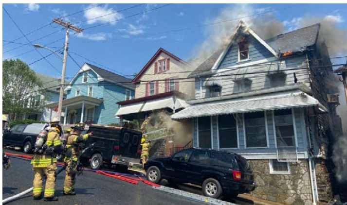
Firefighters on of three-alarm house fire in Brunswick, Maryland