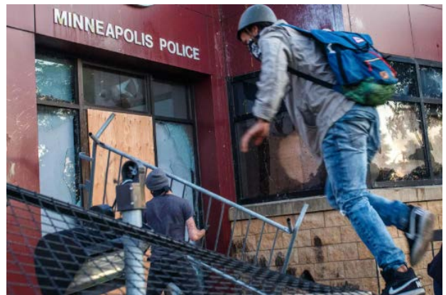
Minneapolis Police Department Third Precinct boarded up after demonstrations and fire