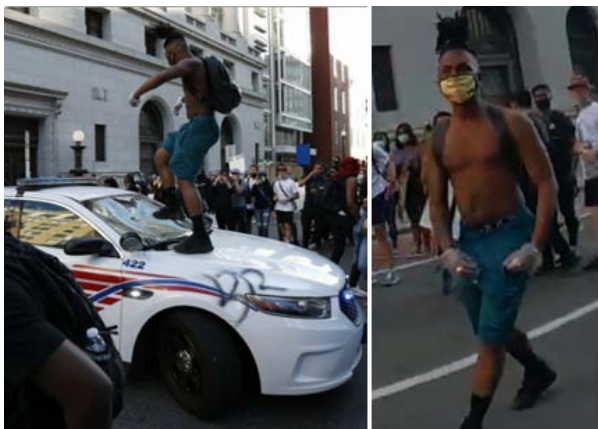
Suspect captured by a camera