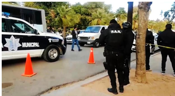
Emergency personnel responds to a school shooting where at least two people were killed.