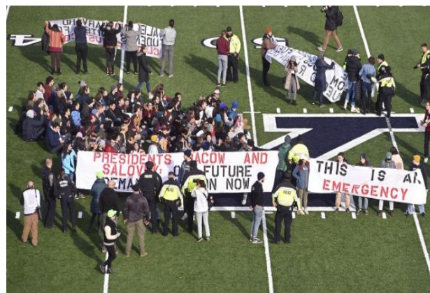
Protesters staged a sit-in at the Yale Bowl during halftime.