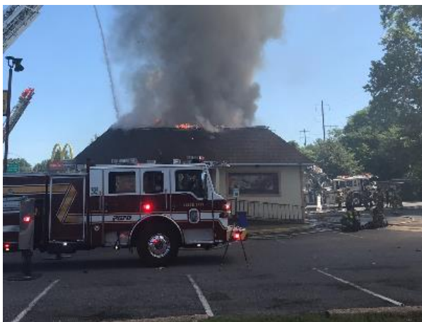
Firefighters extinguish restaurant fire