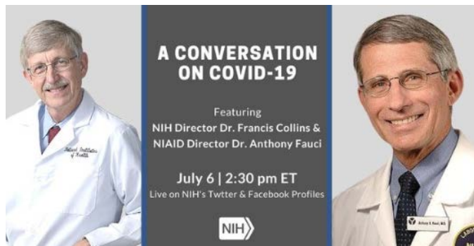
A Conversation on COVID-19 flyer