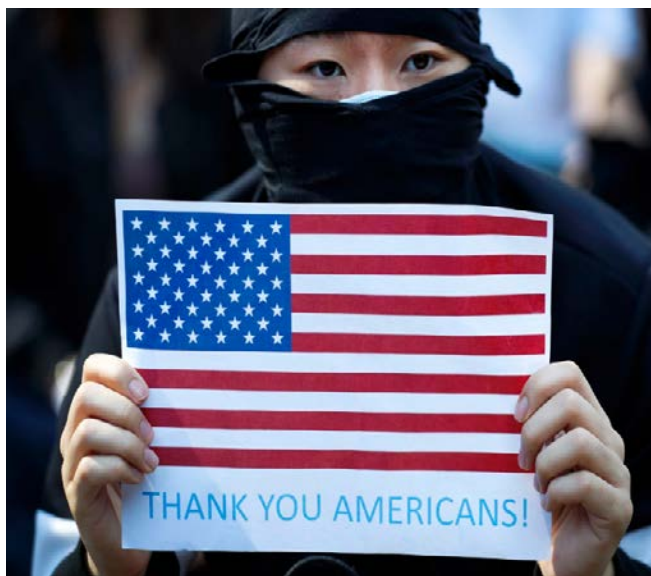
A protester held an American flag at a pro-democracy demonstration in Hong Kong.