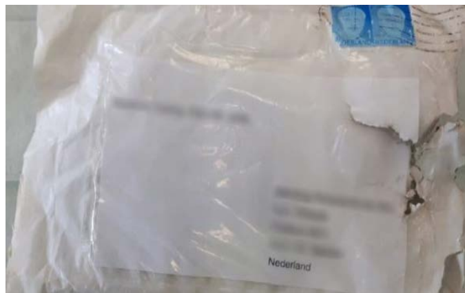
Dutch police warned companies to look out for padded envelopes with two stamps