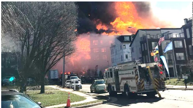
A fire in Fairfax County, Virginia, destroyed three buildings under construction