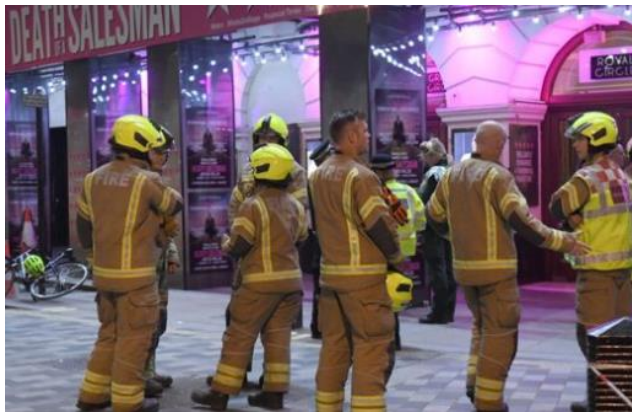
The London Fire Brigade outside of the theater after the ceiling collapsed.