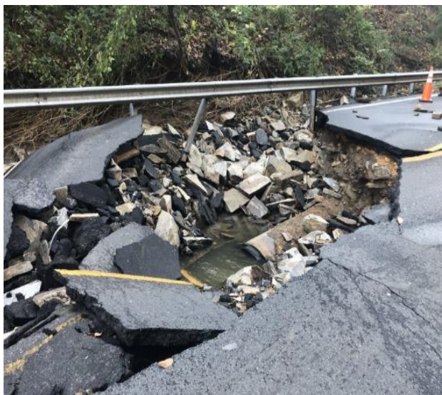
The 36-inch water main break in Arlington County.