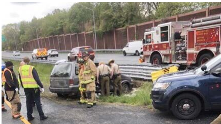
Law enforcement and Fire & Rescue on scene of a single vehicle collision with two trauma patients on I-495 yesterday evening