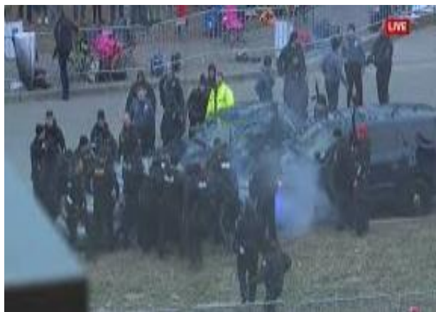
Police stop vehicle after crashing through parade barricade