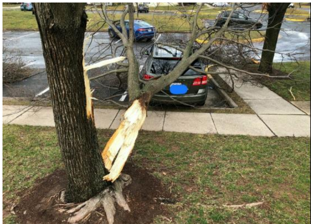
Damage from the tornado in Leesburg, VA