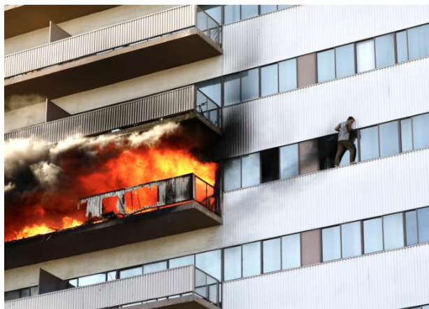
A man trying to escape flames coming from the sixth floor of a 25-story residential building