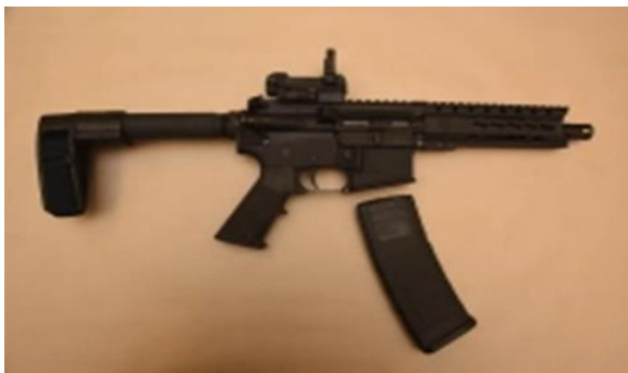
Assault-style weapon recovered from suspect's home