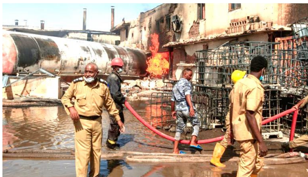
Members of the Sudanese Civil Defense put out the fire at a factory unit